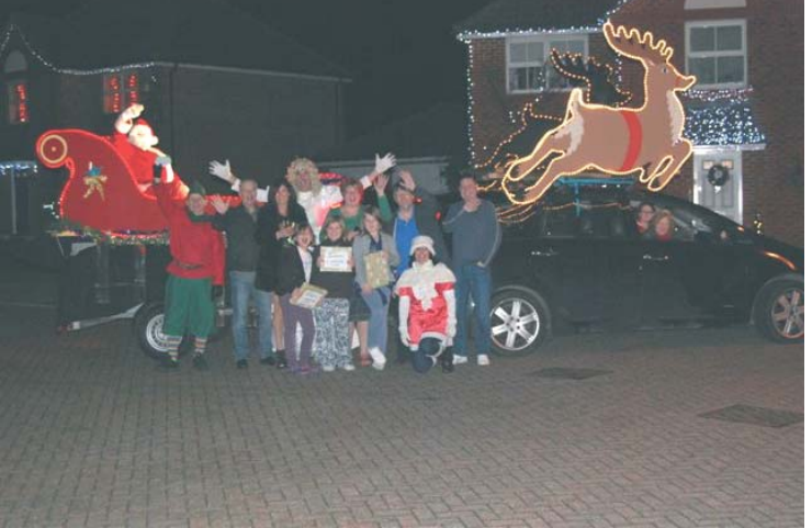
More pictures on the High Halstow website: www.highhalstow.org.uk