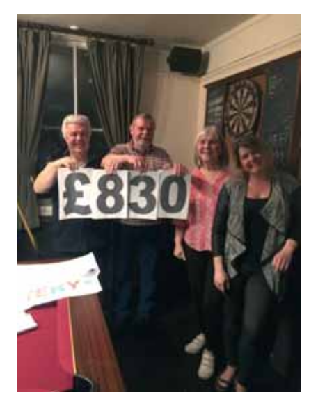
The winner lives in Hoo within the post code area ME3 9EE