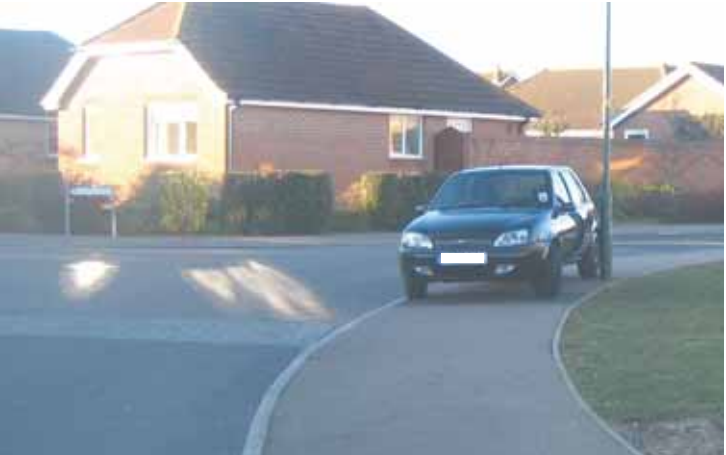
The driver of this car obviously got the path and road confused when they parked!

It has come to the Parish Councils attention that people are parking their cars on the kerbs and paths. This is causing an obstruction to pedestrians and particularly pushchairs and wheelchairs, which then have to negotiate a route around the car either via the muddy grass verge or worse still into the road.