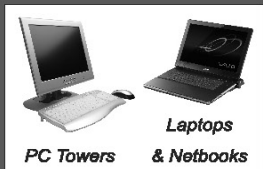
PC Towers & Laptops & Netbooks

Contact Jonathan directly on the Office No: 01474 879878 or Freephone: 0800 321 38 79 Mobile No: 07905 120 557 Web: www.jonathancomputers.co.uk Email: sales@jonathancomputers.co.uk Based in High Halstow so will be quick to respond