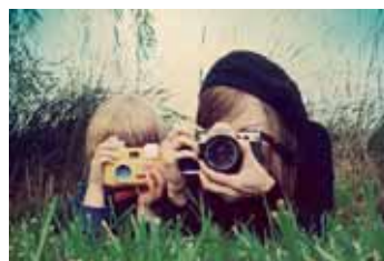
2014 Photographic Competition Please see page 7 for details