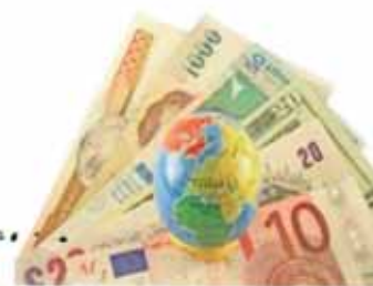
Foreign or UK banknotes of any age