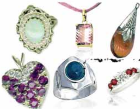
Unwanted gold, silver or costume jewellery including damaged items