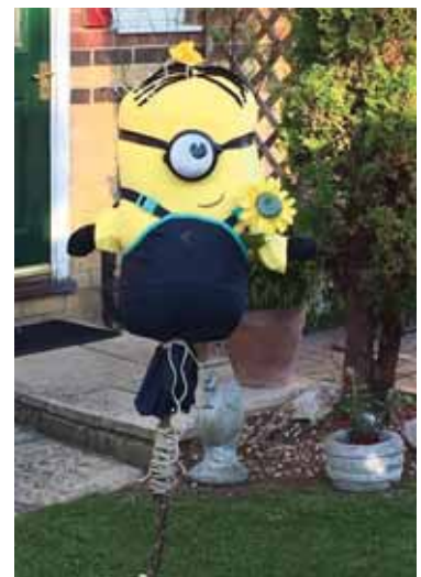
Main photo, top: 1 st place was the San Miguel Scarecrow; Above, left: 2 nd place was the Rod Stewart Scarecrow; Above, right: 3 rd place was the Minions Scarecrow.