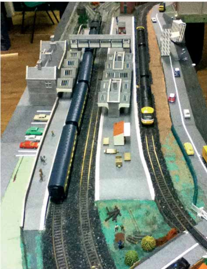
Part of the layout showing the station.

Please contact Ralph on mobile 0752 759 663