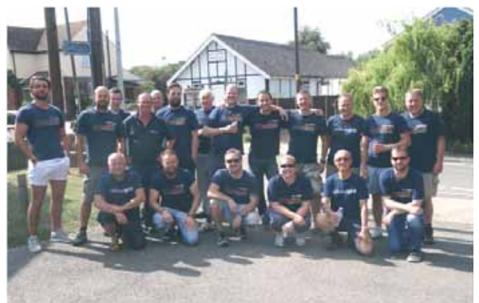
Members of the volunteer group from The National Grid, Grain

Thanks go to LNG and their willing band of volunteers