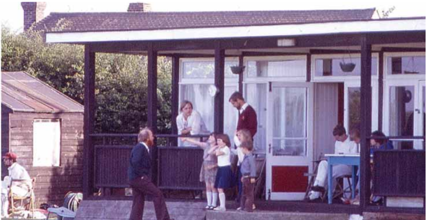
Main photo, above: Cricket Pavillion circa. 1977