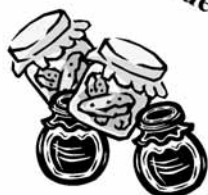
Home made pickles jams and preserves