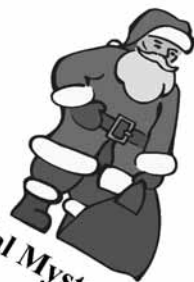
Special Mystery Guest