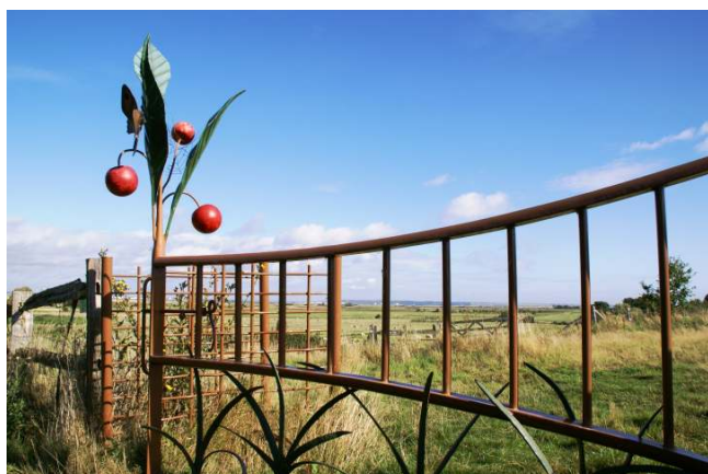
The Cherry Tree Ray Collins (1st place - Places Category)