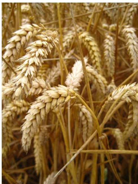
Corn Field - Jessica Spear (1st place - Under 16's Category)