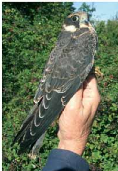
at Northward Hill 20/01/16

The RSPB is the country's largest nature conservation charity, inspiring everyone to give nature a home.