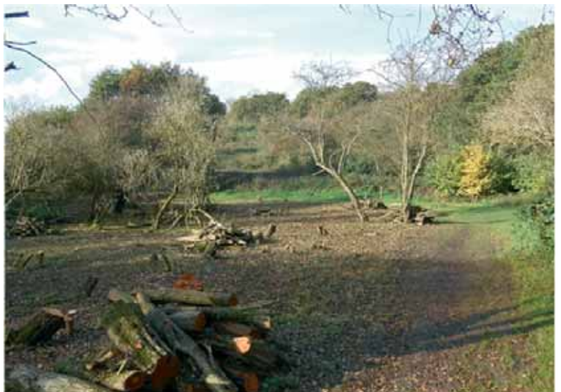
A coppice plot in the Northward Hill woodland