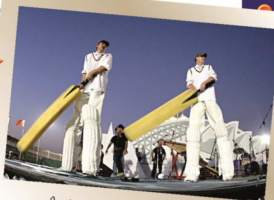
Artizani - Stilt Cricketers

There's plenty to see and do for the whole family, including: