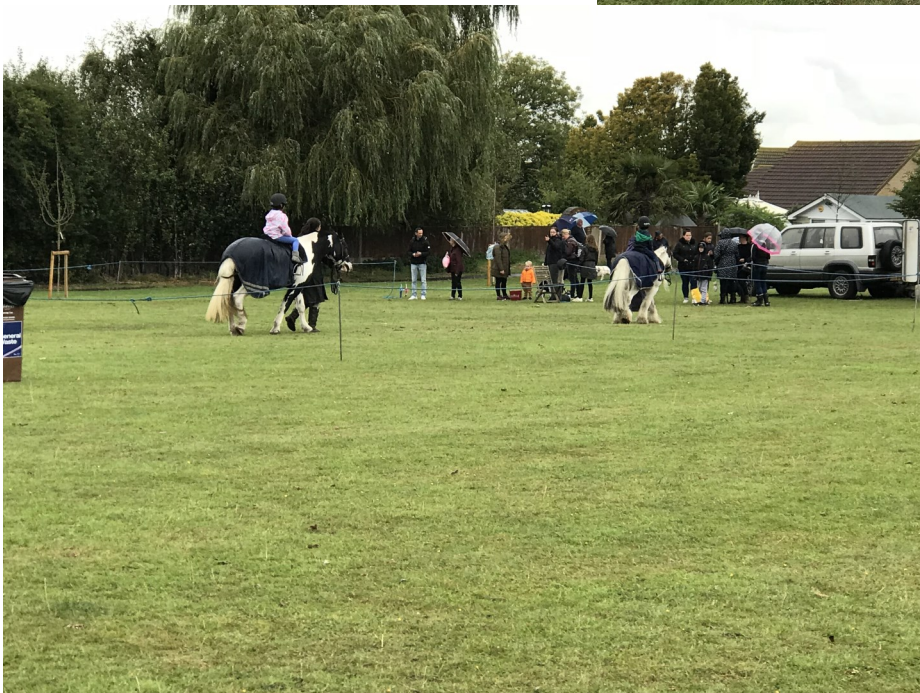
The rain didn't stop play or stop the children riding the ponies either