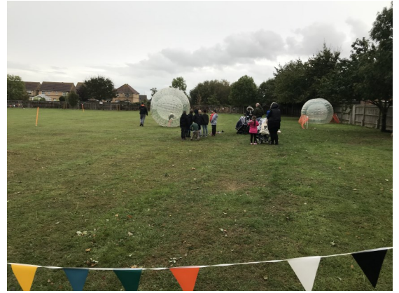
Medway Council Celebratory Event in High Halstow on the Recreation Ground on a very wet September day ...