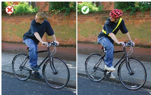
Rule 59: Help yourself to be seen